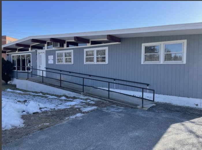
Both houses were built in 1962 and purchased by the MSD in 1970